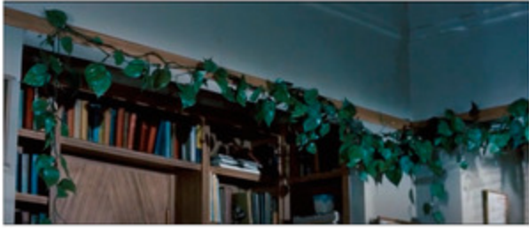
Figure 2. The camera follows the philodendron.