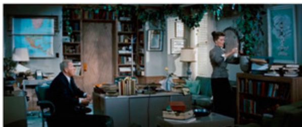
Figure 1. Bunny Watson tends her philodendron.

Disclaimer/Publisher's Note: The statements, opinions and data contained in all publications are solely those of the individual author(s) and contributor(s) and not of MDPI and/or the editor(s). MDPI and/or the editor(s) disclaim responsibility for any injury to people or property resulting from any ideas, methods, instructions or products referred to in the content.